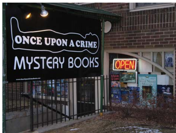
The launch site

The next day, we had to get back to the real world of sales and reviews. Surely this rush